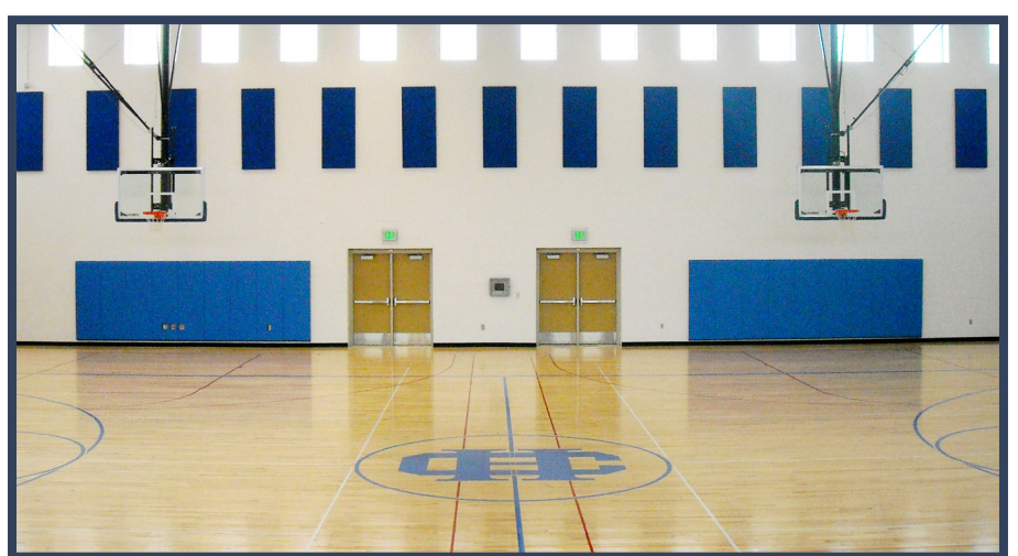
Hylander Center Fitness Center

For drop-in hours, please contact Columbia Heights Recreation at (763) 706-3730.