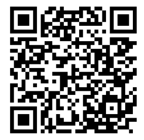
Scan To Apply

4141 University Ave. NE Columbia Heights, MN